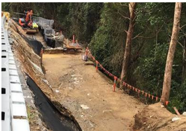
View looking north at CH 6700 showing concrete piers installed for Gabion Wall G1.