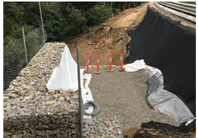
Gabion Wall G6 - northern section