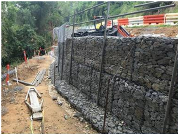
Gabion Wall G1 (looking south) towards bored piers area

NOTE: Traffic restrictions continue on this section of Mount Nebo Road.