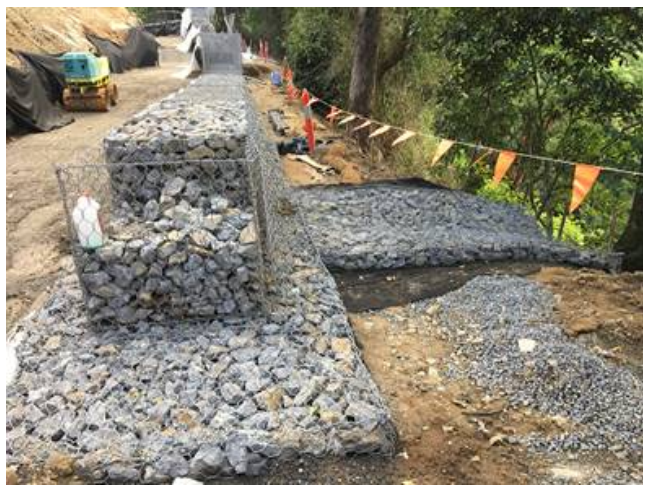
View looking north showing wall and drainage rock revetment for Gabion Wall G1.