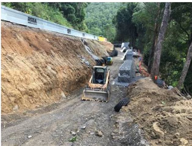
View looking north at CH 6700 showing wall and drainage rock revetment for Gabion Wall G1.