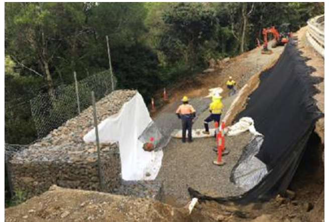
Gabion Wall G6 - northern section