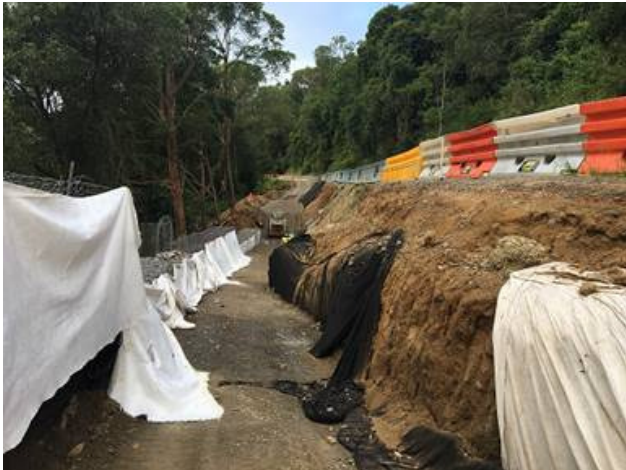
Gabion Wall G1 (looking south) towards bored piers area