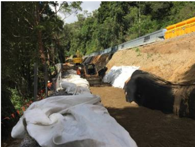
Gabion Wall G1 (looking south) towards bored piers area