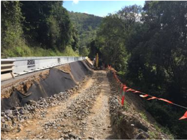
View looking north at CH 6700 showing wall and drainage rock revetment for Gabion Wall G1.