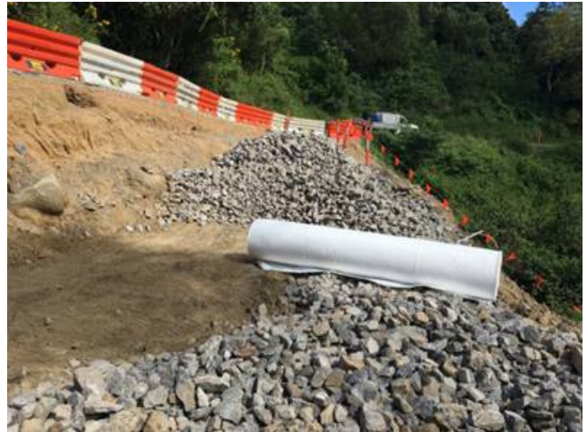
View looking north showing entry to work area at CH6650.