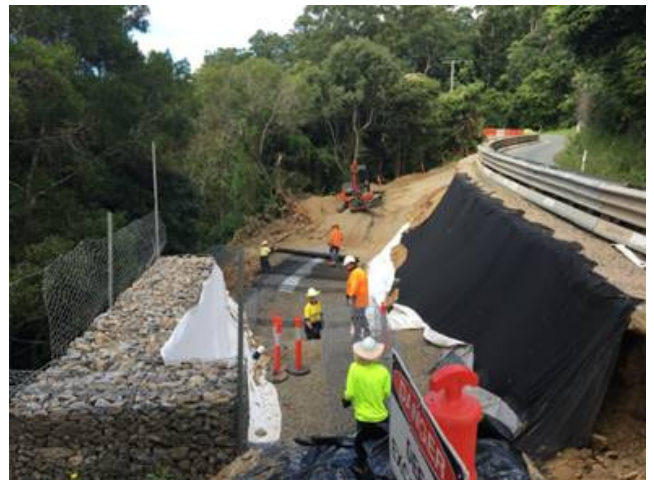
Gabion Wall G6 - northern section