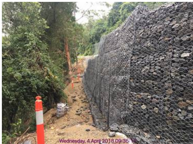
Gabion Wall G1 (looking south)