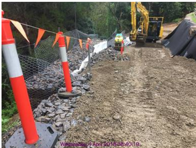
Gabion Wall G6 (looking south)