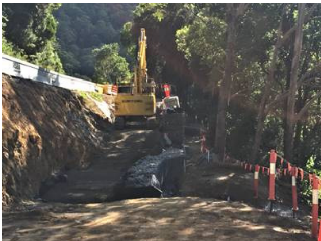
Gabion Wall G1 (looking south), approx. 25% complete