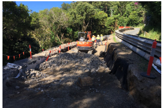
Gabion Wall G6 (looking south), approx. 60% complete