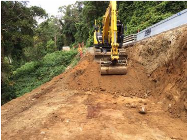
Gabion Wall G1 (looking south), approx. 30% complete