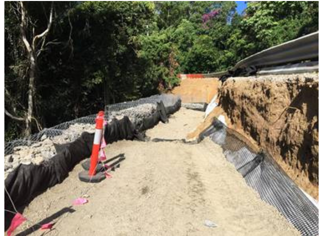
Gabion Wall G6 (looking south), approx. 65% complete