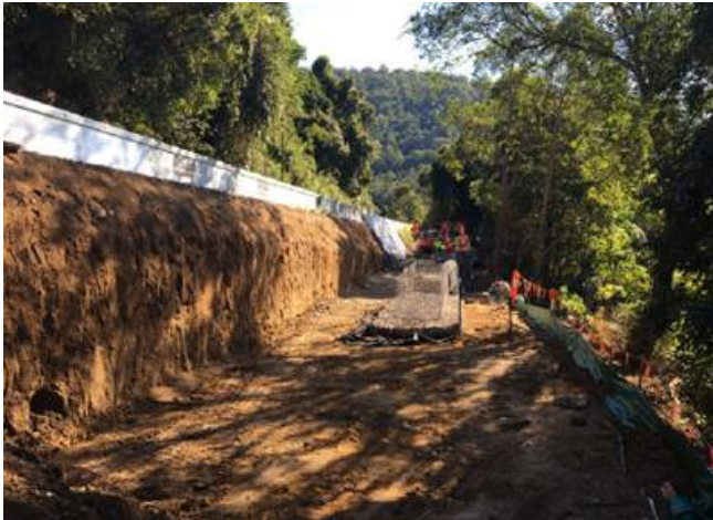
Gabion Wall G1 (looking north) Ch 6760