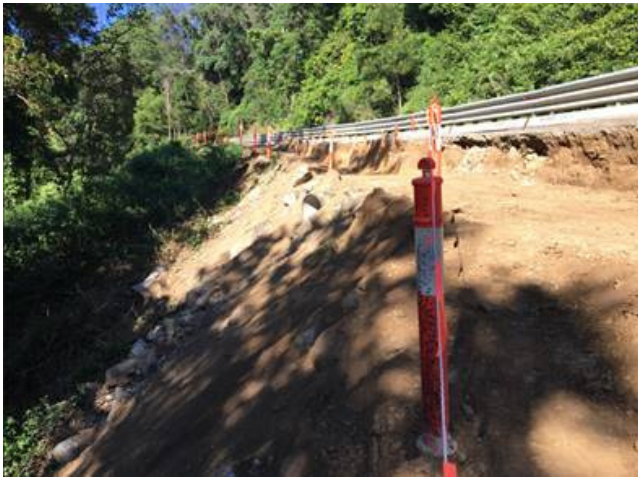
Gabion Wall G1 (looking south) Ch 6760, soil nail and concrete bored piers for this area. Excavation to continue downwards approx. 3m