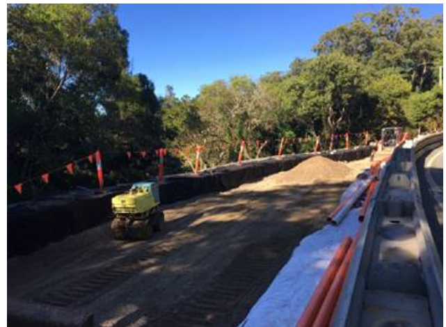
Gabion Wall G6 (looking south), approx. 80% complete