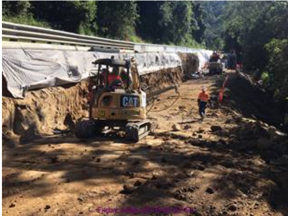
Progress with Wall G1