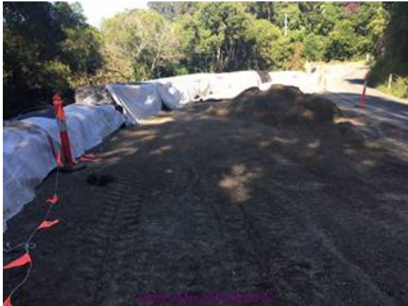
Progress with Wall G6