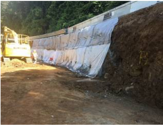
Progress with Wall G1