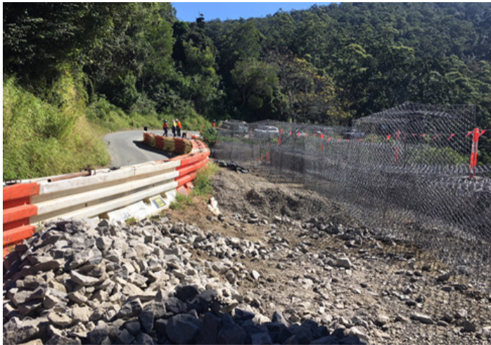
Progress with Wall G1 - northern tie-in location