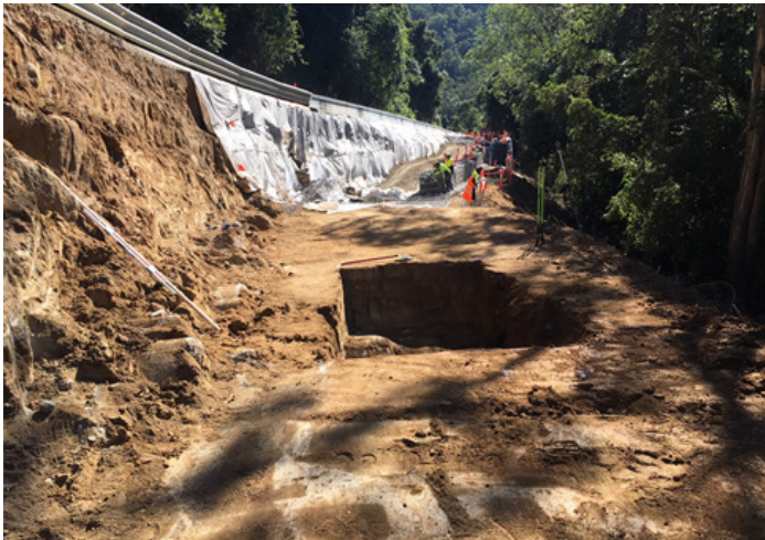
Progress with Wall G1 - mid-section looking north

NOTE: Traffic restrictions continue on this section of Mount Nebo Road.