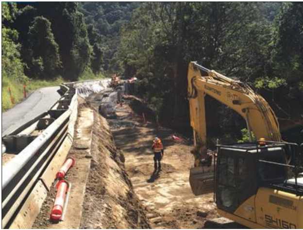
Wall G1 continuing (looking north)