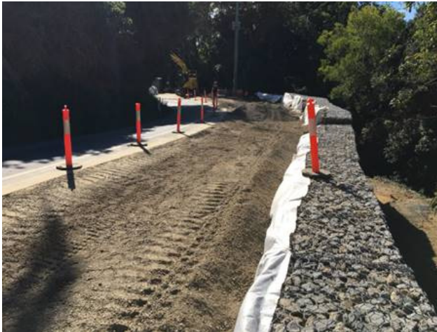
Wall G6 Complete (looking north)