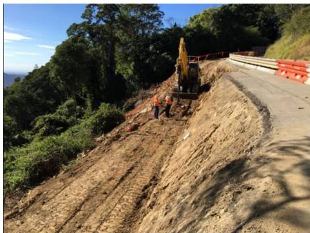
Excavation for Wall G2 commenced