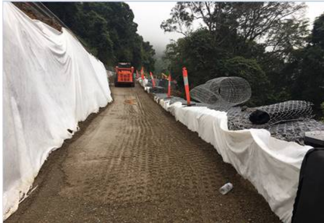
Wall G1 continuing (looking north)