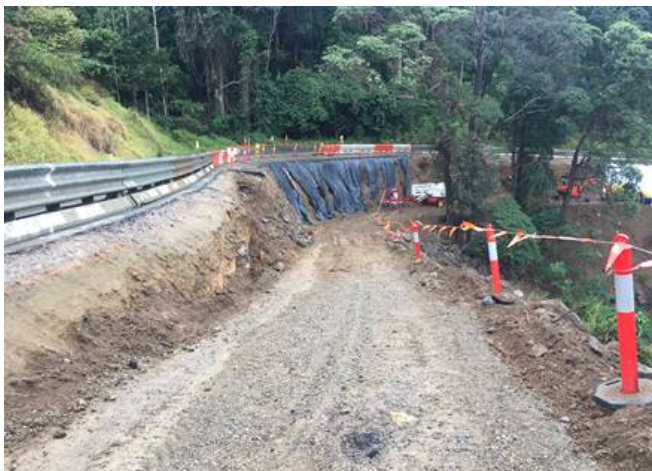
Excavation for Wall G2 commenced