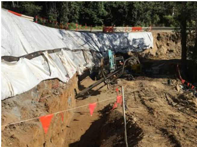
Excavation for Wall G2 commenced