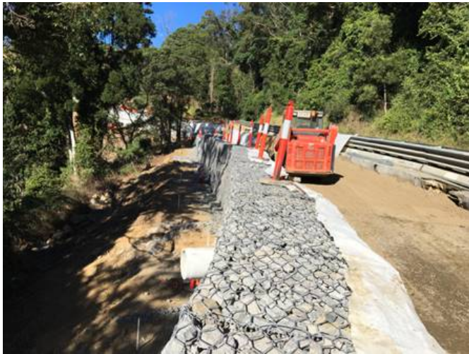
Wall G1 continuing (looking south)