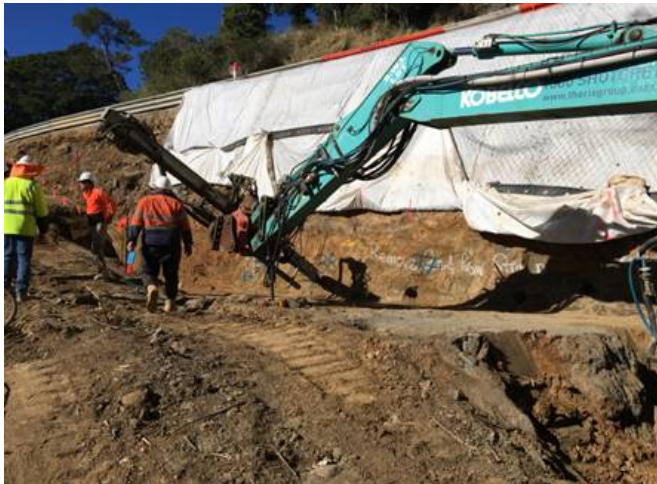
Wall G2 soil nailing