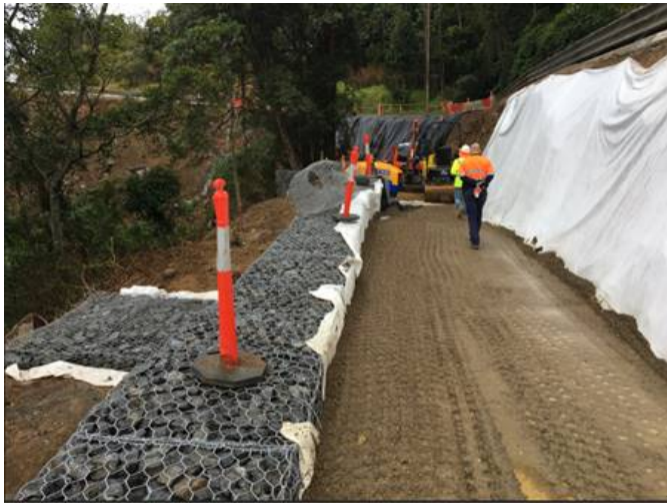
Wall G1 continuing (looking south towards wall G2)