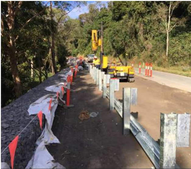
Installing guardrail Wall Section 1 (looking south towards wall G2)