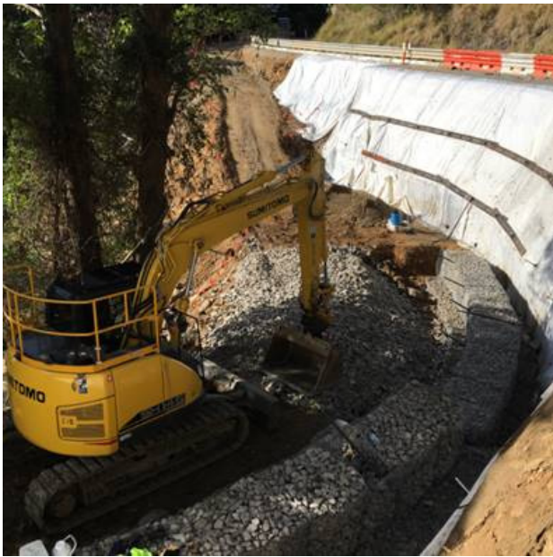
Wall G2 looking south