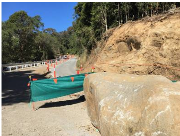
Embankment to be stabilised with Greenax. Boulder removed from embankment. (looking south towards wall G2)