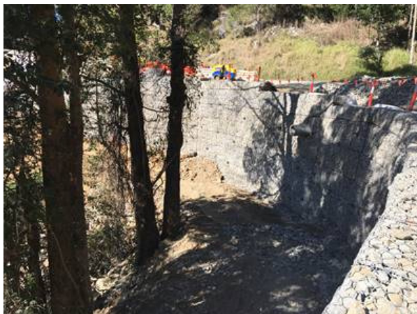
Wall G2 looking south