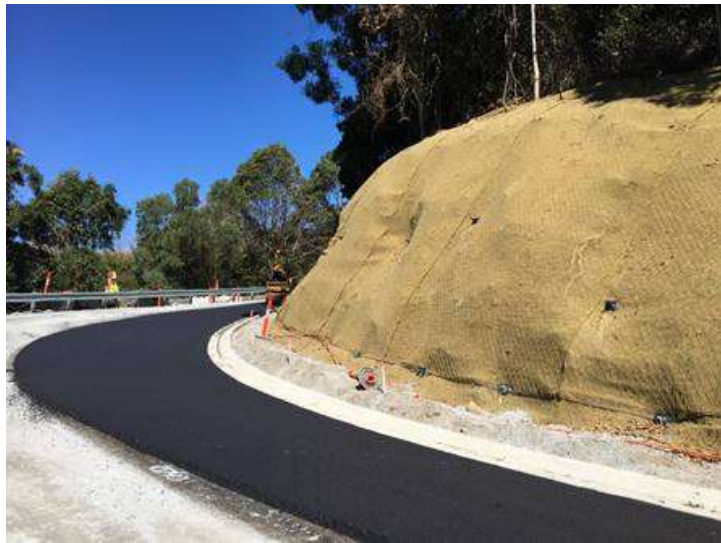
Greenax embankment, Chainage 6900