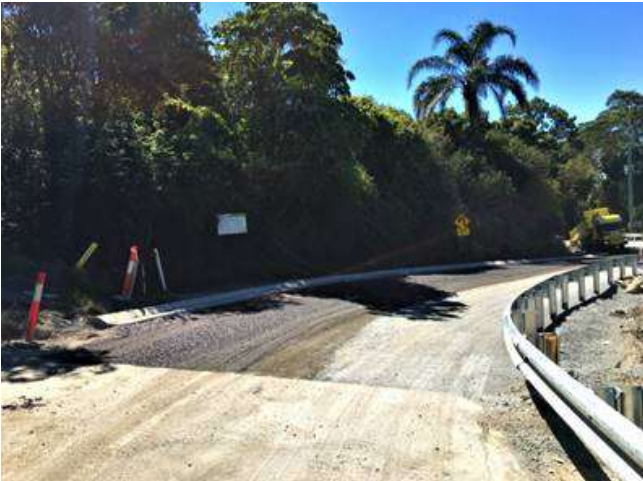
Road at Chainage 7000 (looking north)