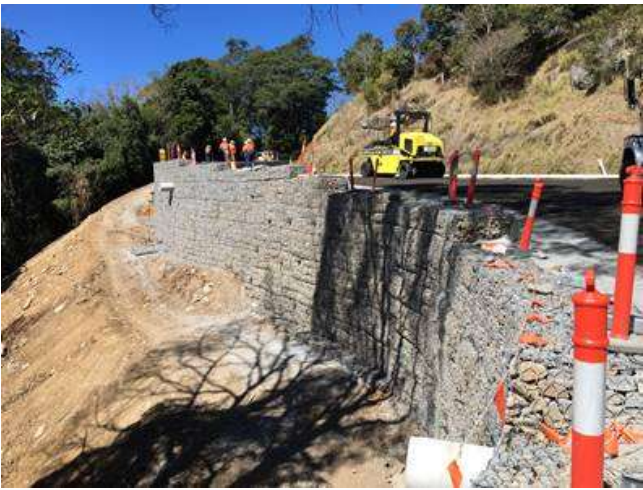
Wall G2 looking south