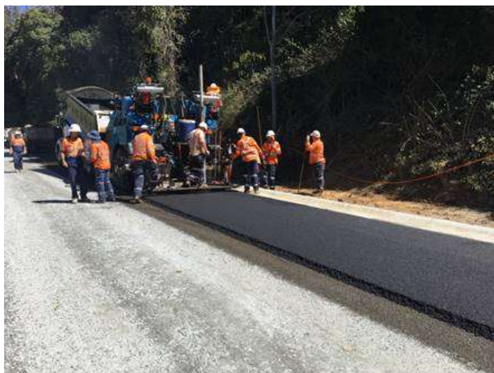
Laying of Asphaltic Concrete