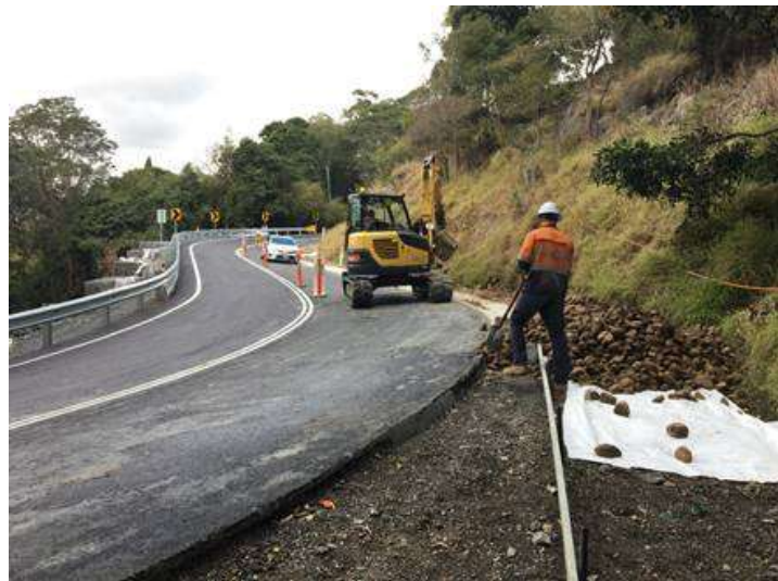
Placing rock roadside drain, Chainage 6900