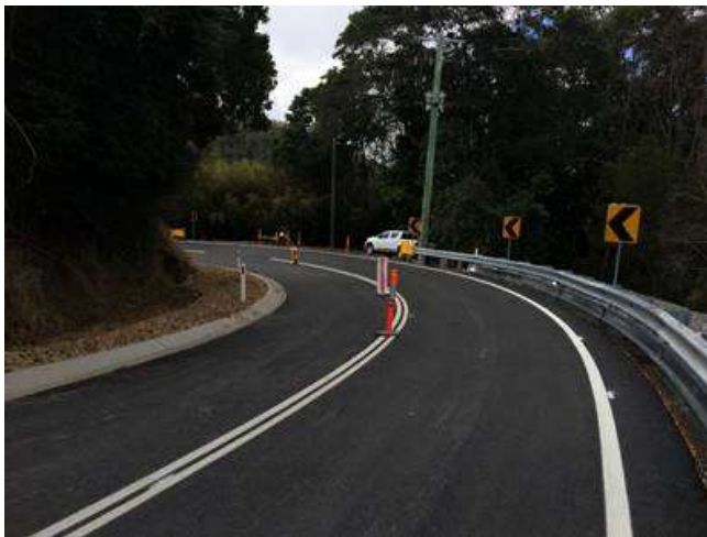
Road at Chainage 7000 (looking north)