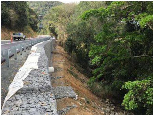
Wall G2 looking south, embankment to be seeded