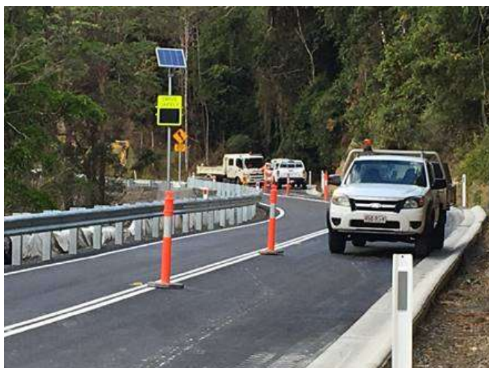
Looking south, approx. Chainage 6750. Note Variable Message Sign installed