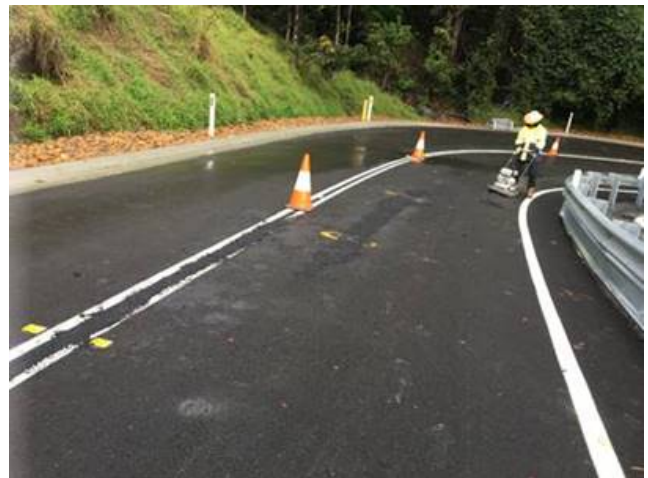
Temporary road rectification