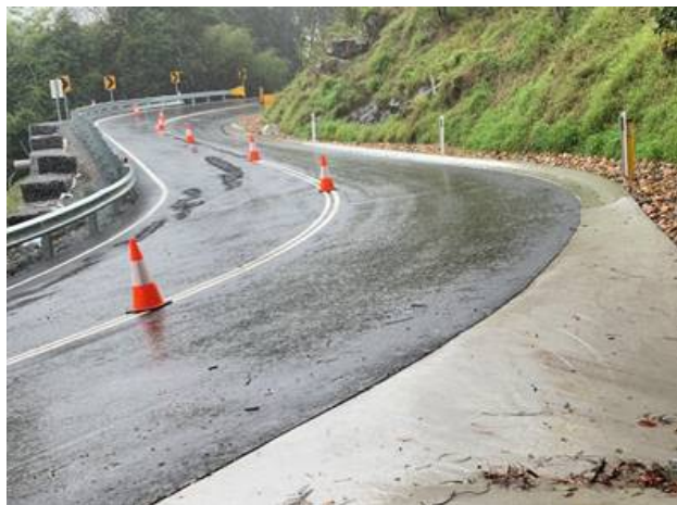
Looking south towards road rectification area